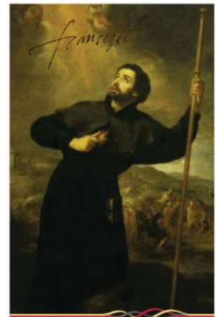
Praying with Saint Francis Xavier The Novena of Grace

God our Father, as St Francis Xavier travelled to the ends of the earth, impelled by love of Christ and afire with his good news, give me the trust and the grace to base all that I do entirely on you, safe in the knowledge that you raise up the lowly and fill them with good things. Through Christ our Lord. Amen.