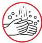
Wash Your Hands Frequently