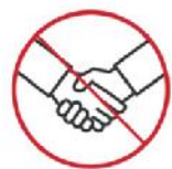
Don't Shake Hands (Avoid Contact)