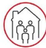
If Sick Stay at Home