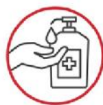
Use Hand Sanitizer